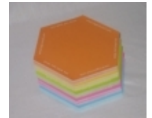
Post-it hexagons in large and medium, 5 bright colours, 50 sheets per pad

Visit the on-line shop at www.logovisual.com for a full range of resources including packs of magnetic hexagons, Post-it hexagons, a range of portable and wall mountable whiteboards and all the accessories you need.