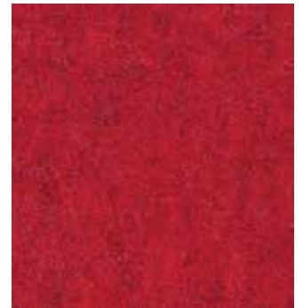
207 Red Fleck