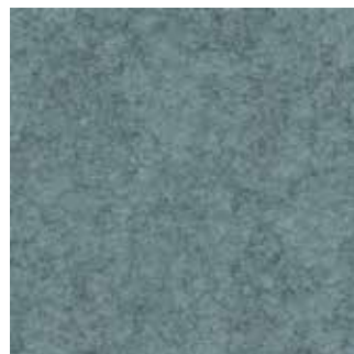
213 Blue Grey Fleck