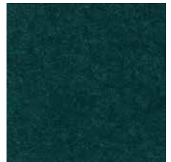
211 Teal Fleck