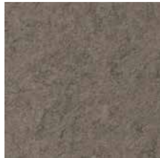
202 Dark Beige Fleck