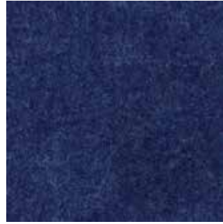
215 Blue Fleck