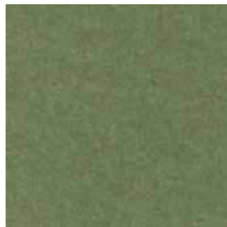
219 Olive Green