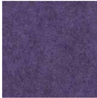
208 Purple Fleck