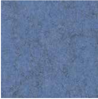
214 Light Blue Fleck