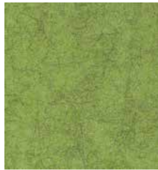
209 Light Green Fleck