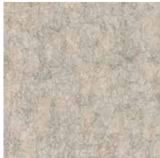
201 Beige Fleck