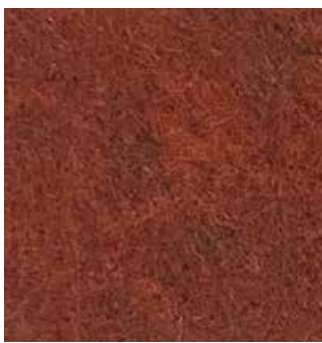
303 Rust Red Fleck