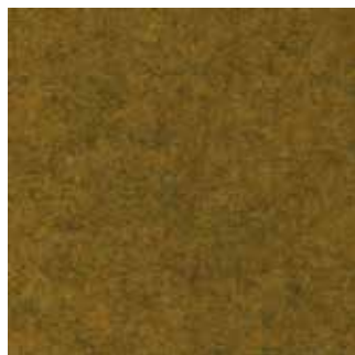
203 Mustard Fleck