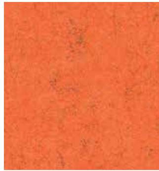
206 Orange Fleck