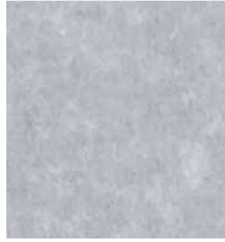
300 Stone Grey