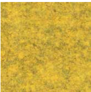
204 Yellow Fleck