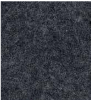
104 Charcoal Grey