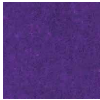
304 Bright Purple