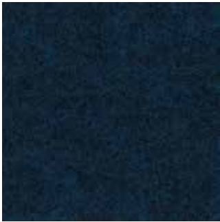
216 Dark Blue