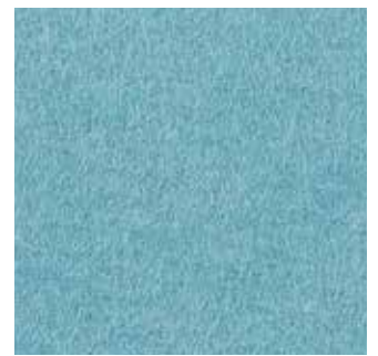
402 Coastal Blue