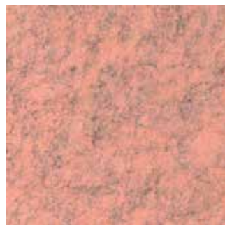
205 Pink Fleck