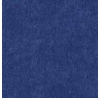
106 Midnight Blue