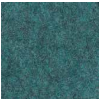
212 Peacock Fleck