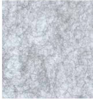
102 Ice White