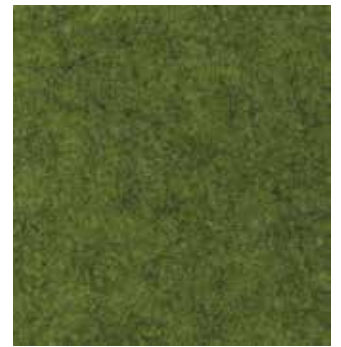
210 Dark Green Fleck